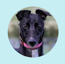
Meet Beauty She is the dog of the month, find out more about this beautiful girl...