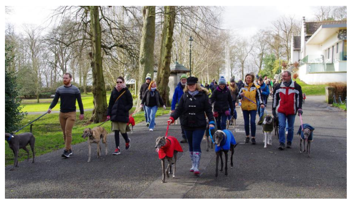
Monthly walks are currently cancelled until further notice due to the coronavirus, keep an eye on Facebook and the Forum for updates!