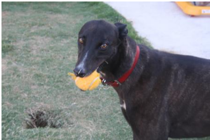
Toby Large male Greyhound dog listed on 26-10-08

Toby is brilliant in the house, and fantastic with children. He is what we call a 'specist' and tends to be scared of and not understand any breed of dog that is not a Greyhound (or similar to, for example a Whippet) Toby has done very well, he has handled a freaked out Greyhound puppy with such tolerance we are really proud of him. Toby is a lovely boy, came back into rescue due to a relationship break up. He lived with a female whippet and a cat for the past two years. Toby would need to go to a home where there is another Greyhound as a companion (male or female) or with a family who is willing to adopt two Greyhounds