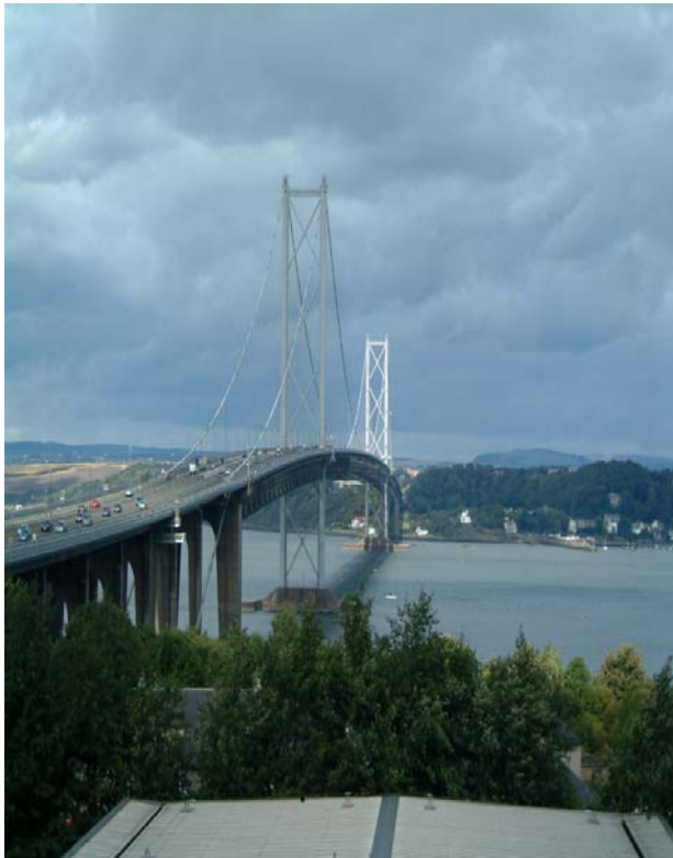
The walk route !

We couldn't have ordered better weather for the walk, a bit overcast with cooling breeze! 31 hounds with attached humans set out for what was to some a personal challenge to walk across the Forth Road Bridge.