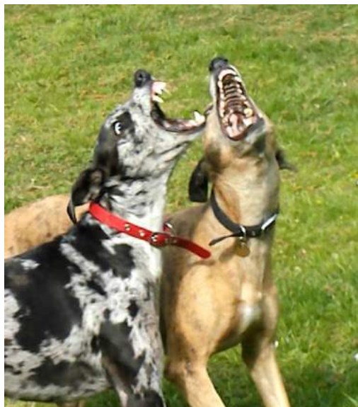
A biteyface howl

It is NOT advisable to interfere in a game of biteyface unless you have a suit of armour complete with gauntlets at hand. 😬 The girls engaged in this mad game on many occasions, and I gradually realised that they were neither deranged or vicious, but just having fun....lurcher style.