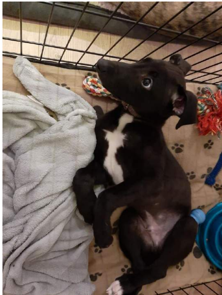
In his crate