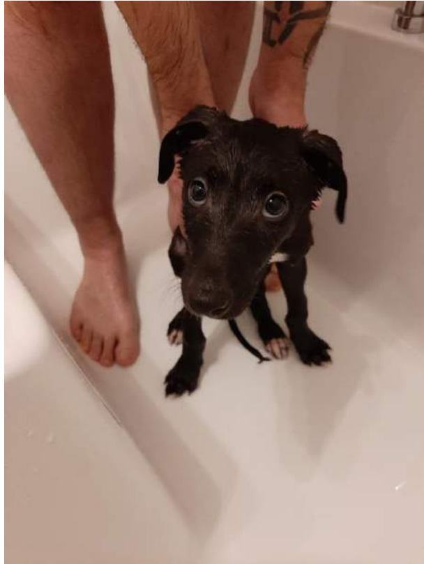
“Enjoying” a shower