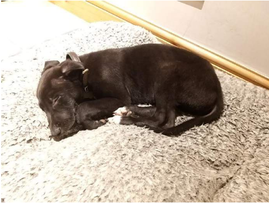
Lupin's first evening