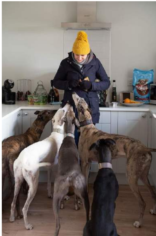
Part of the pack