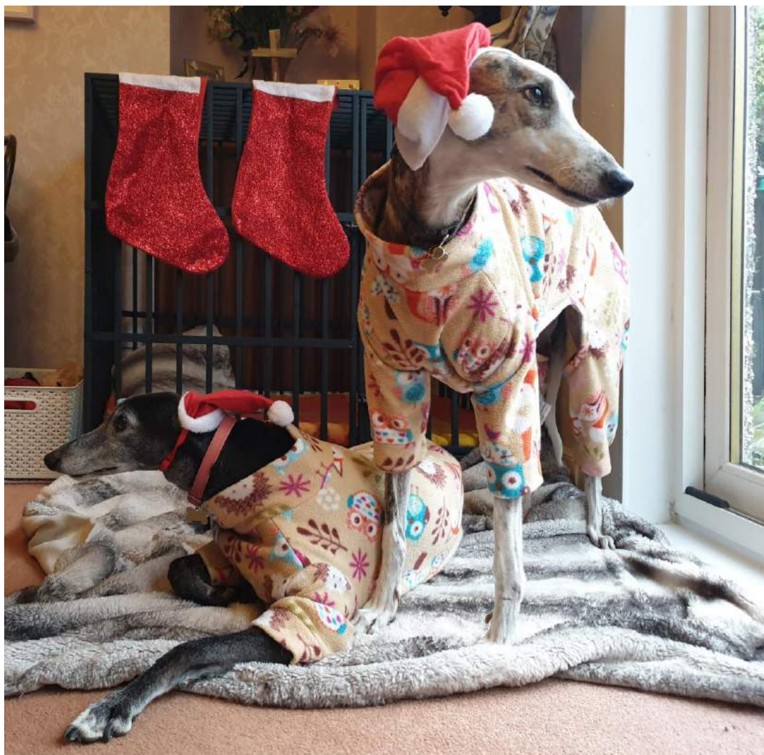
Looking out for Santa

"Adopting just one Greyhound won't change the world, but the world will surely change for that one Greyhound."