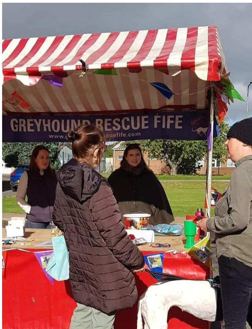
Fundraising at Dalgety Bay Community Market

"Adopting just one Greyhound won't change the world, but the world will surely change for that one Greyhound."