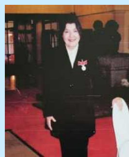
Tales from the Archives

Continuing our series describing GRF's development from modest beginnings in 2005.