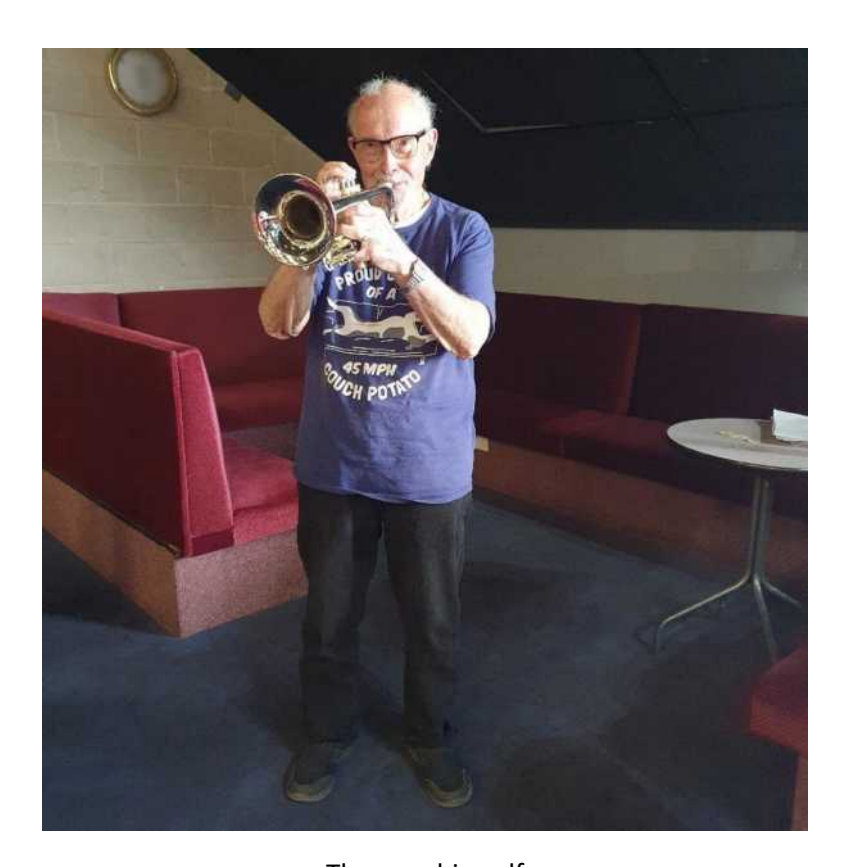
The man himself June 2024