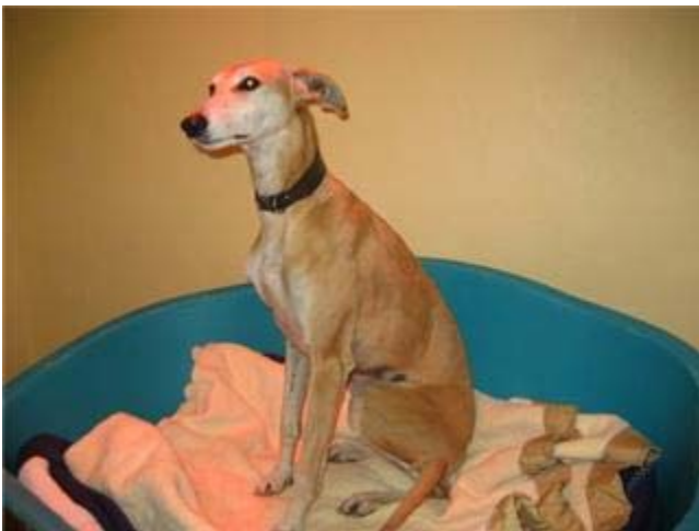
What's all the fuss about !!!

April - After many appeals, posters and several weeks of searching the fields of Cupar in Fife a young female greyhound called Gypsy was eventually saved and re-homed via the GRF web site.