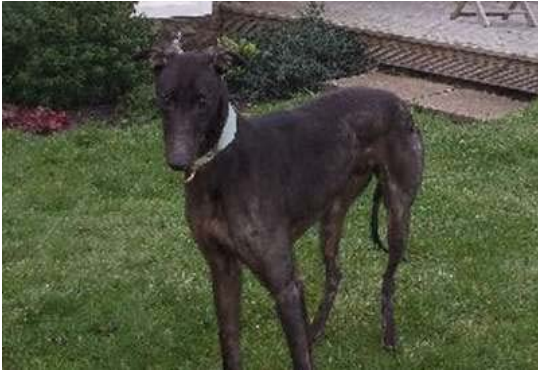
Rory not looking at his best

A further 9 greys also found homes in March.