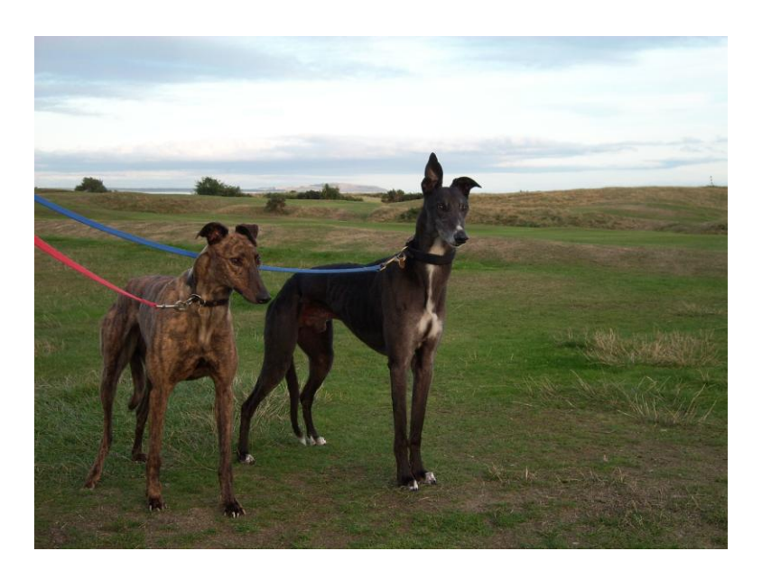
Jock and Foxy heading for The Beach!

The most recent one involves foraging. While walking on the old railway line, Mike and I noticed some lovely brambles and sampled a few. The dogs looked interested so we offered them some and they thought they were quite nice. Thereafter, they made a bee-line for the bush and picked their own!