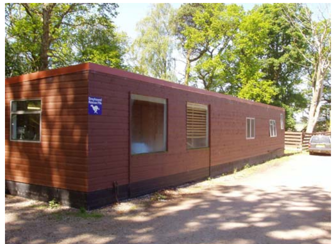
The new GRF kennel block

As many of you will be aware the last few months at Seafield have been horrendous with our then landlord making life difficult throughout. However, in some strange way he has actually helped us grow from strength to strength. If he hadn't evicted us we wouldn't have been looking for new premises and would have missed out on Baltree altogether!!!