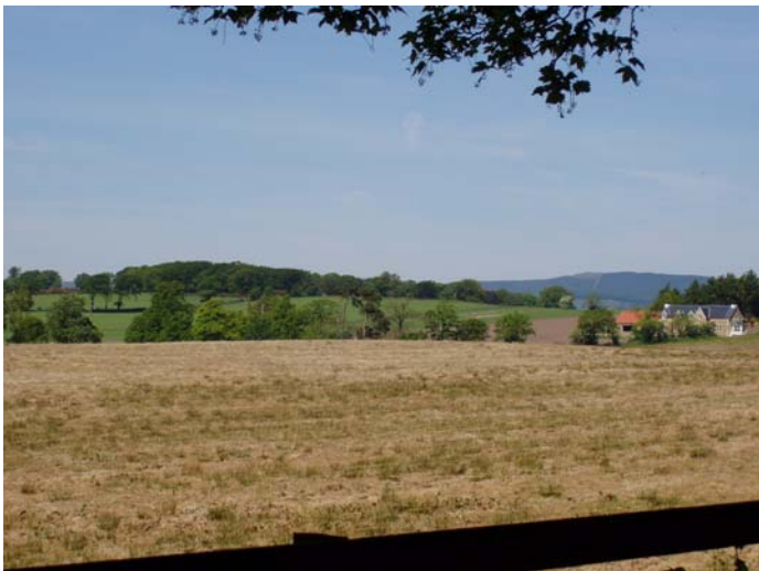
Just another reason to visit Baltree

So I am sure we can all agree from these photographs that we now have an excellent facility, run by excellent people and all devoted to rescuing greyhounds, but don't take our word for it why not come out and visit us and see for yourself, we now don't have the restrictions we did have at Seafield and we have our own car park !