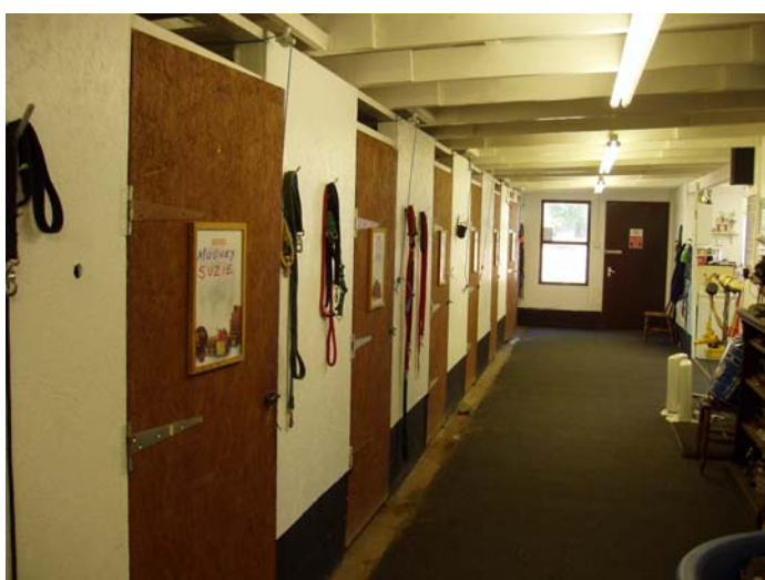
Just a few of the kennels with the "inmates" names on the doors

As you will see from the pictures we have quite a bit of fencing to maintain and over the next few months we would like to start doing this so if you can help in some small way. Then it would be much appreciated, keep an eye on the forum for further information on this.