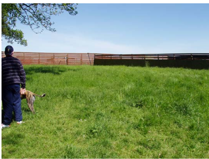
Just a snap shot of one of our runs

Next month we hope to bring you some photos and details of our other facility at Union farm. This is another purpose built kennels with some excellent facilities and staff and as with our Baltree kennels you are all welcome to visit.