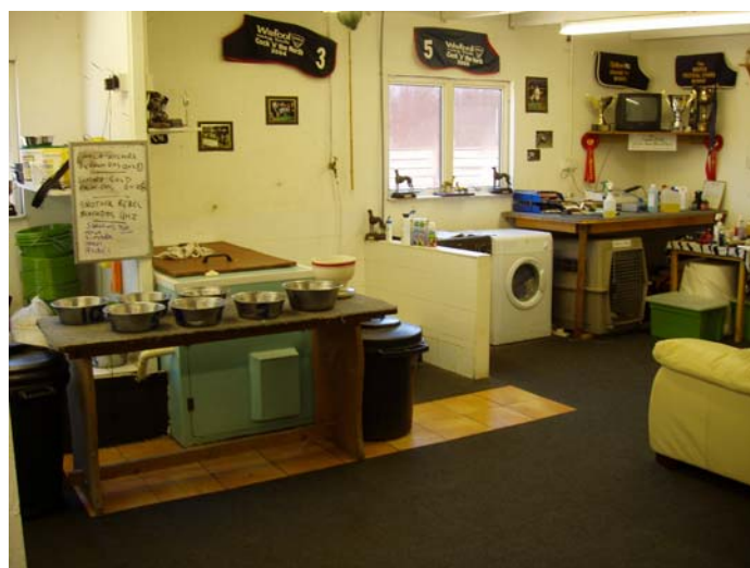
Kitchen facilities along with our greyhound Jacuzzi !!

In the future it is planned to build more kennels in each of these runs and thus extend our capacity. We also hope to have the grass cut in the near future !!