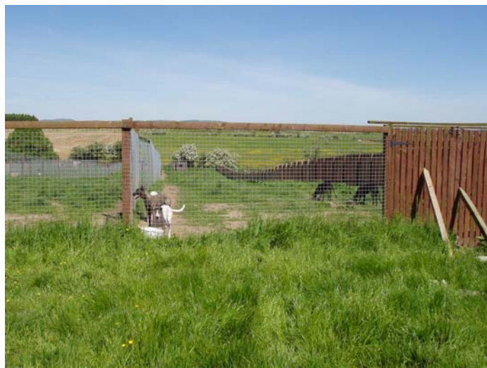
Some more Run's

Over the whole of May we re-homed a staggering 18 dogs !! Including our best in show winner DEWEY ! Unfortunately over this period we also took in to our kennels a further 16. Fortunately we now have the space to help keep these dogs, while the kennels are not a hotel ! They do now allow us to save many more greyhounds. In total we have now re-homed a staggering 268 dogs and are now homing in on that 300 mark.