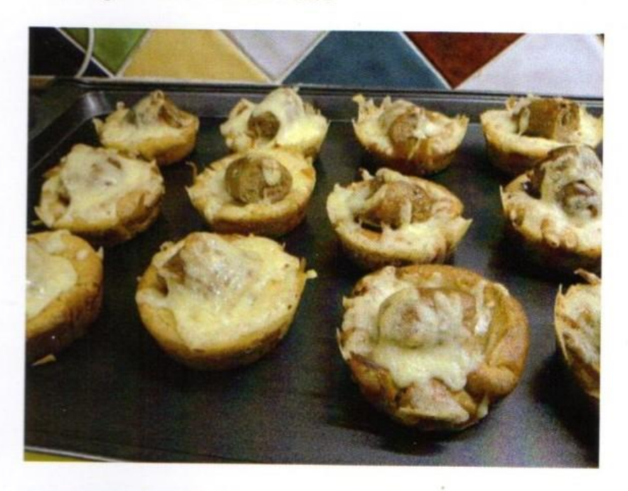
8 Sausages – cooked and each cut into 3 pieces 200g Cheese - grated