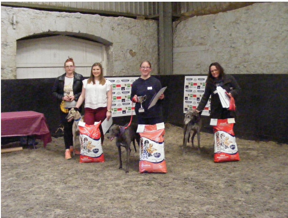
BEST IN SHOW