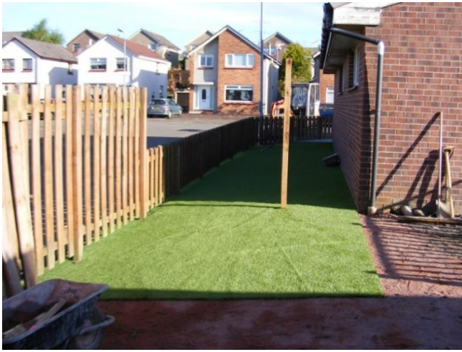
Grass laid on type 2