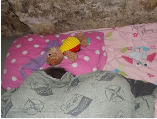
Lexi zonked out after a hard day's holiday fun!