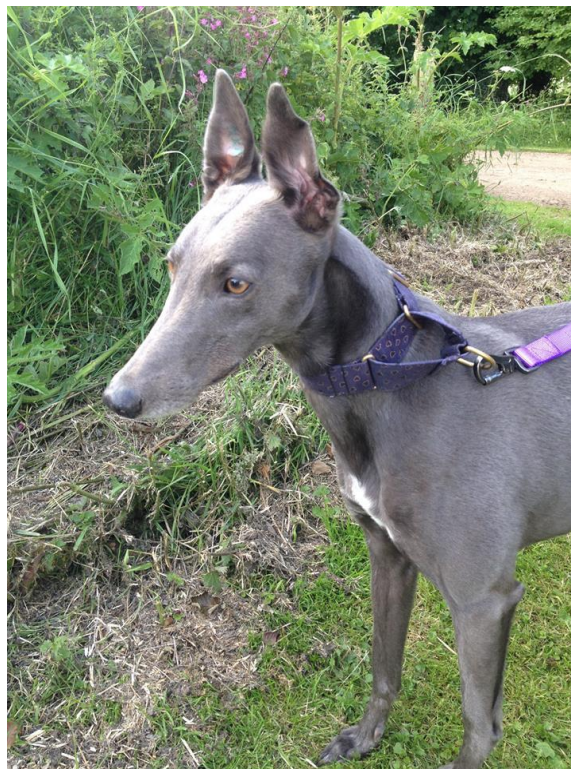
I thought I saw a bunny rabbit (I did see one honest!)