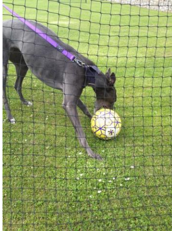
Stop the goal at all costs! (Chew the ball)